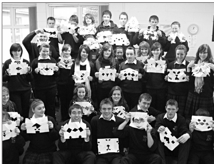
Mentors in training.

Since September 1st the Mentors in MCS have supported and assisted first year students as they settle in to school. On the first day of term Mentors worked with First Years. They prepared a range of activities for First Years to encourage and facilitate the making of new friendships. Students participated in a series of events centred around arts, sports and class games.