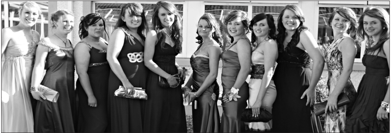
Here come the girls!!!