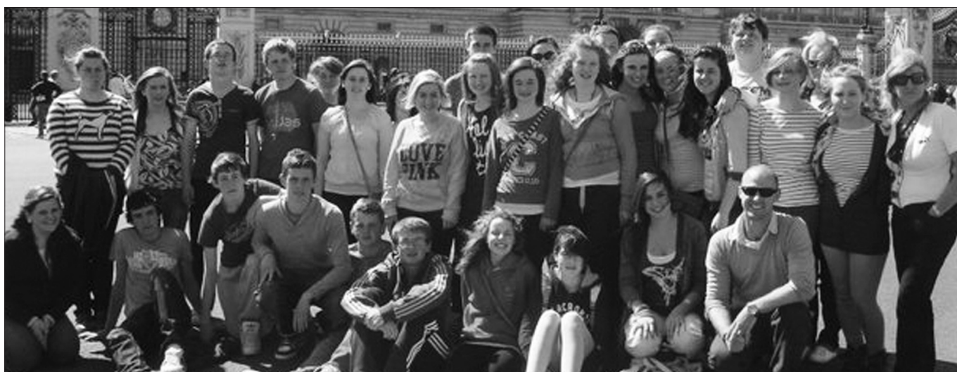
Transition Year group enjoying London trip.

Wednesday was the final day of the trip and the group enjoyed a visit to Thorpe Park. Thorpe Park is one of the biggest theme parks in Europe and the group could not wait to get on the rollercoaster's and rides spread all over the theme park. One of the tallest rollercoasters in Europe, Stealth , didn't faze many of the students, however some decided it was just too much! Many thanks to those who organised this great trip.